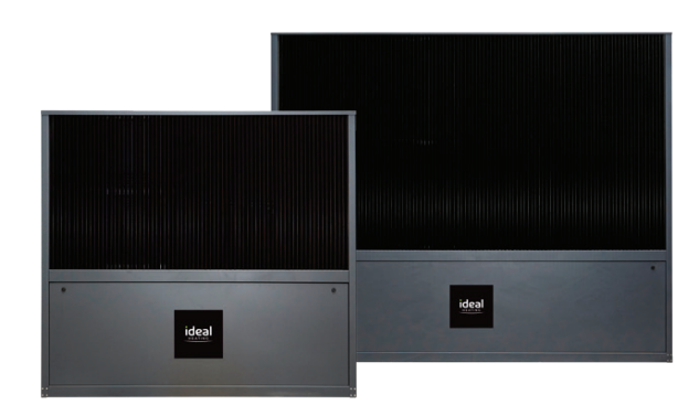
ECOMOD CO2 & CO2Q COMMERCIAL HEAT PUMPS PROVIDE ULTRA-LOW GWP OF 1 DUE TO THE USE OF R744 (CO2) NATURAL REFRIGERANT.

Furthermore, the latest heat pumps use refrigerants with a low Global Warming Potential (GWP). Our ECOMOD natural refrigerant heat pumps use either R290 or CO2 with a GWP at 3 and 1 respectively.