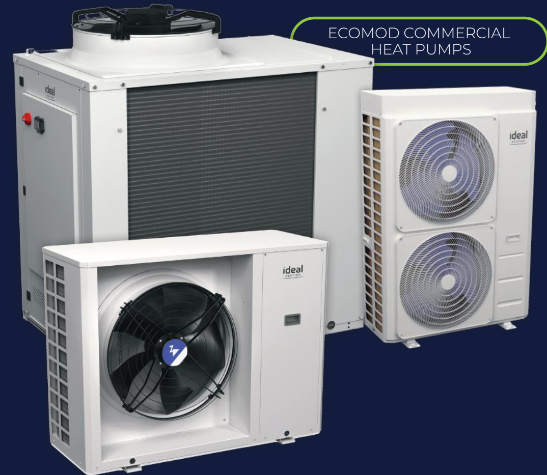
ECOMOD COMMERCIAL HEAT PUMPS